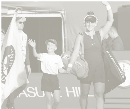
NATIONAL BANK LITTLE ACES PLAYER IDENTIFICATION