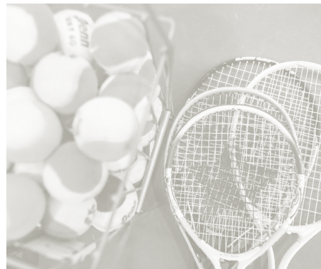
WPDP TRAINING ENVIRONMENT